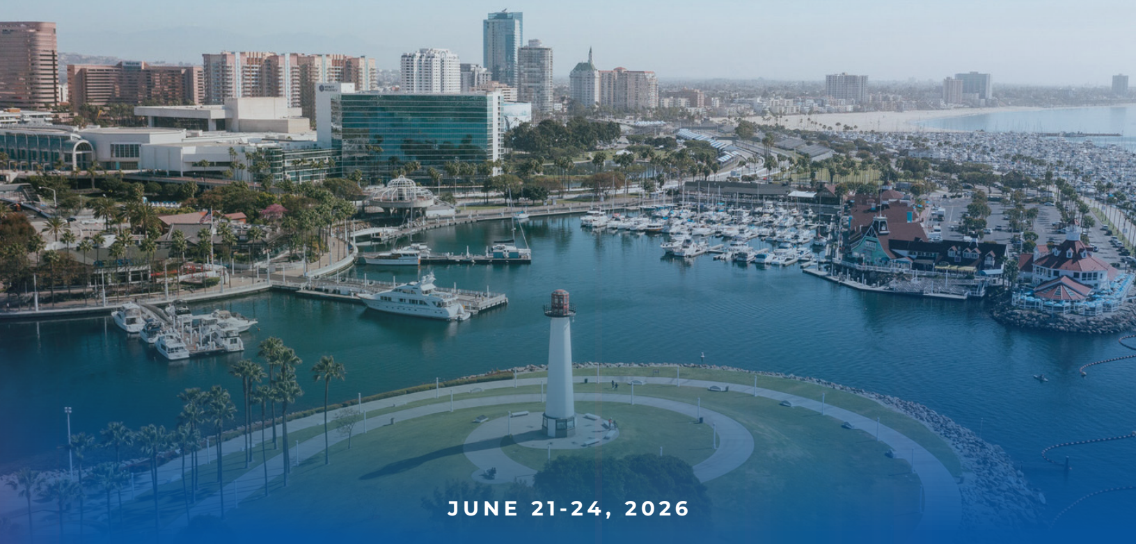
EXHIBIT & SPONSORSHIP PROSPECTUS