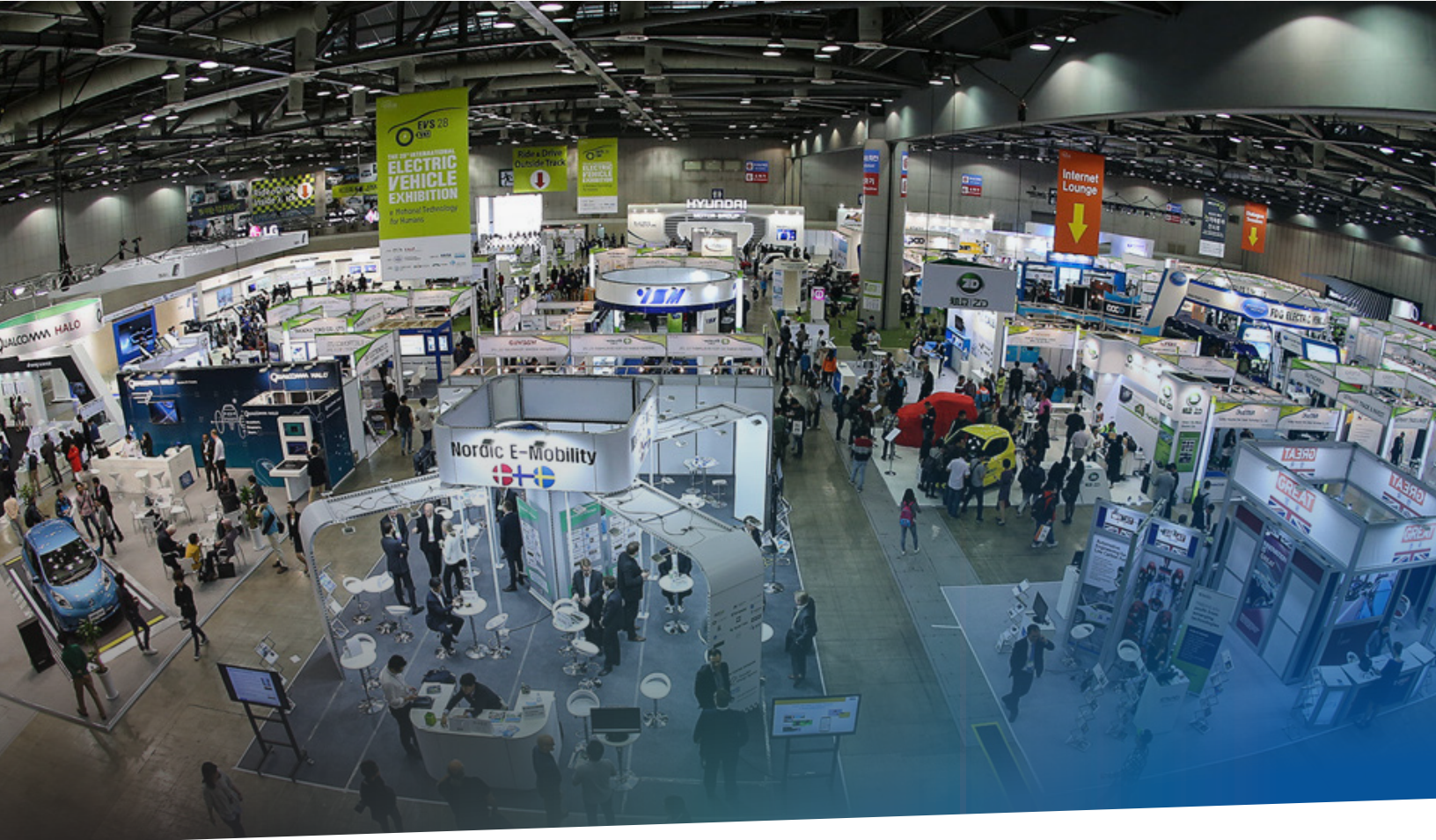
EXHIBIT & SPONSORSHIP INQUIRIES

Call your regional sales representative to customize your EVS39 experience. We are happy to create a program that aligns with your interests and budget.